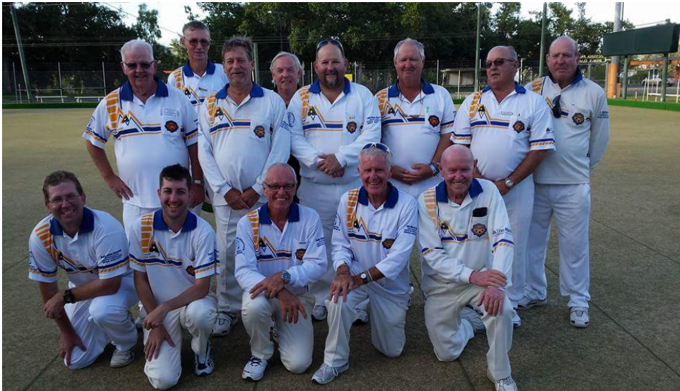
VPBC Mens Pennant Team Winners are Grinners.. Well Done Everyone

Nomination Forms for 2017 Competitions - Mens, Open and Mixed, will be available after the December Meeting. Please be aware when you enter these competitions that they are played throughout the entire year. Games Directors have a tough job navigating through the games and accommodating bowlers work commitments, holiday arrangements, CQ and other Bowls Club Events and personal life commitments too. They try to the best of their ability to be fair while still getting the games played. Priority in the first half of the year must be given to the games that require a winner to represent VPBC at the playoffs between other clubs. Therefore Club games, Open and Mixed are more likely to be played during the second half of the year.